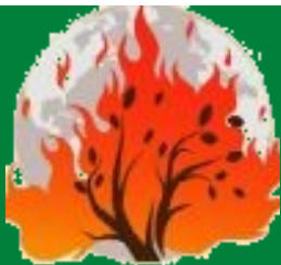
The logo for Season of Creation

A local result of the recent very wet weather.