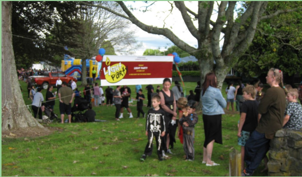
Light Party 31 October 2022