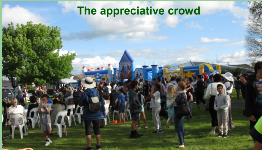
The appreciative crowd